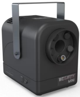
Octopus Biosafety Mini