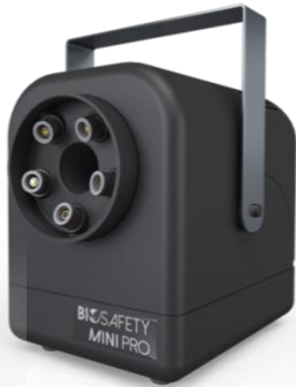
Octopus Biosafety Mini - PRO